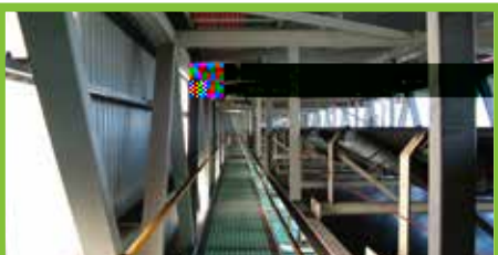
Anti-Slip Aluminium Net