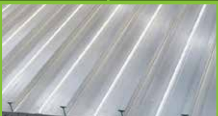
Stiffened Shell Plate